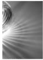
BRIDGEWELL CONSULTING LTD