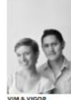
VIM & VIGOR