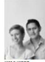
VIM & VIGOR