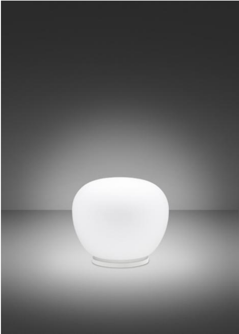
Table lamp with stem, diffuser in satin-finish white blown glass. Supporting structure made of metal painted white.