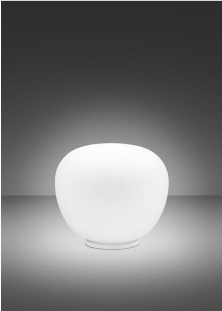
Table lamp with stem, diffuser in satin-finish white blown glass. Supporting structure made of metal painted white.