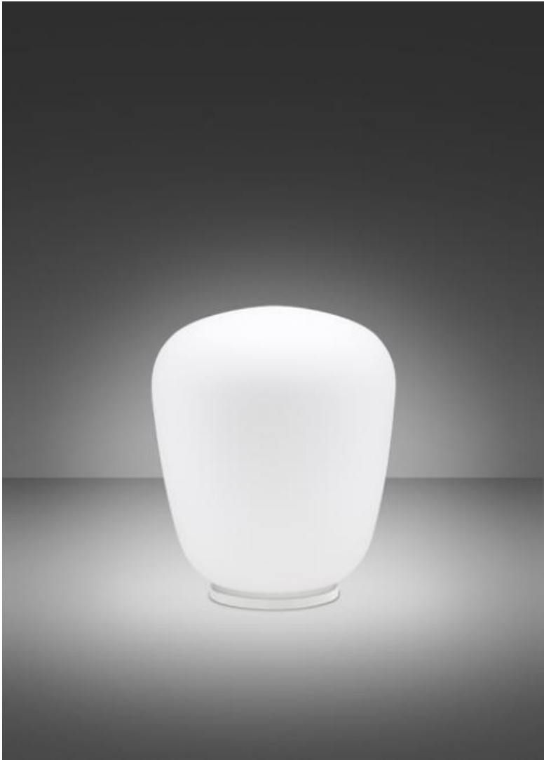
Table lamp with diffuser in satin-finish white blown glass. Supporting structure made of metal painted white.