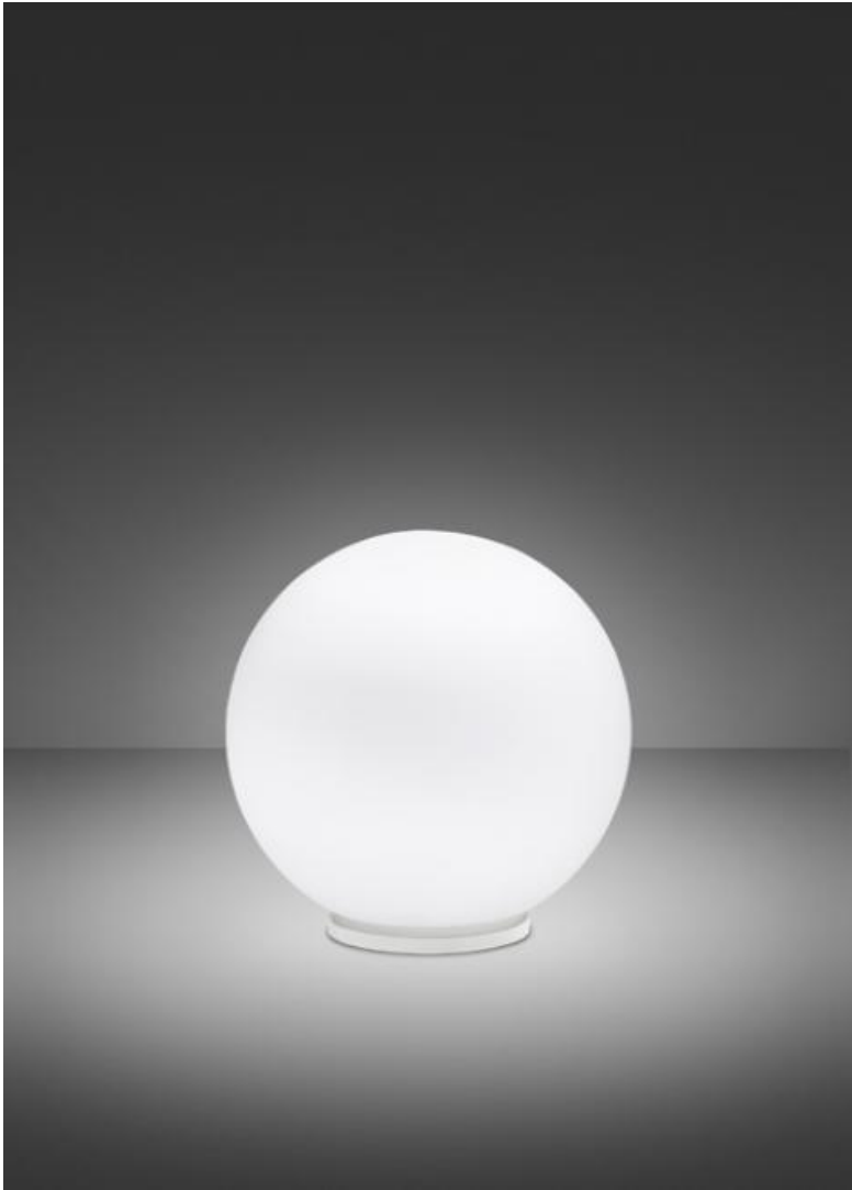
Table lamp with diffuser in satin-finish white blown glass. Supporting structure made of metal, painted white.