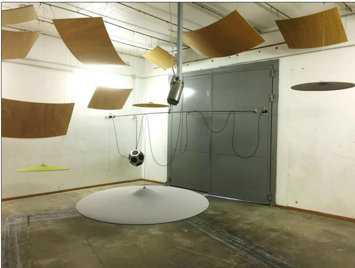
Photograph of the item

The item is manufactured by the customer and it was placed in the reverberation room by Istituto Giordano staff.