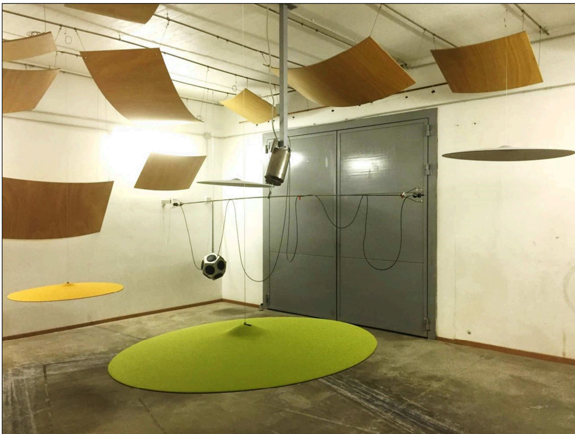
Photograph of the item

The item is manufactured by the customer and it was placed in the reverberation room by Istituto Giordano staff.